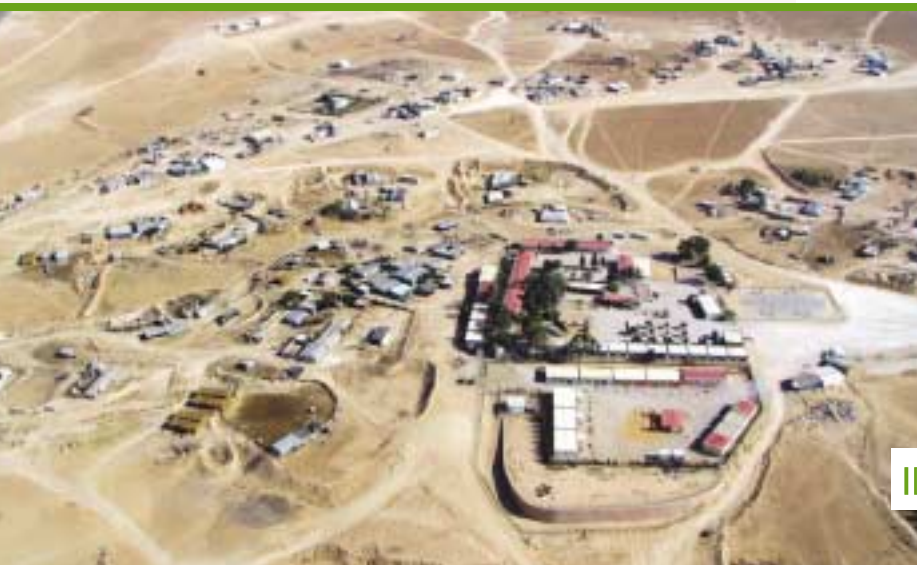
||| Illegal building in the Bedouim "dispersal"

Ten thousand new housing units in Rahat for the benefit of the Bedouin population. The Israeli government's investment in Rahat involves planning, developing, and marketing land for constructing more than 10,000 new housing units for Bedouin residents.