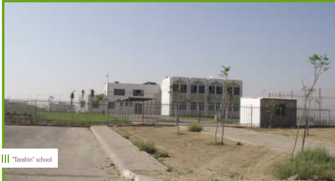
||| "Tarabin" school

Because of the firm stance of the Israeli government and its readiness to compromise, many Bedouin land claimants have realized the advantage of accepting a settlement. Since the state began to submit counter claims, many claimants have contacted the authorities in order to reach an agreement with the state and accept its generous offer.