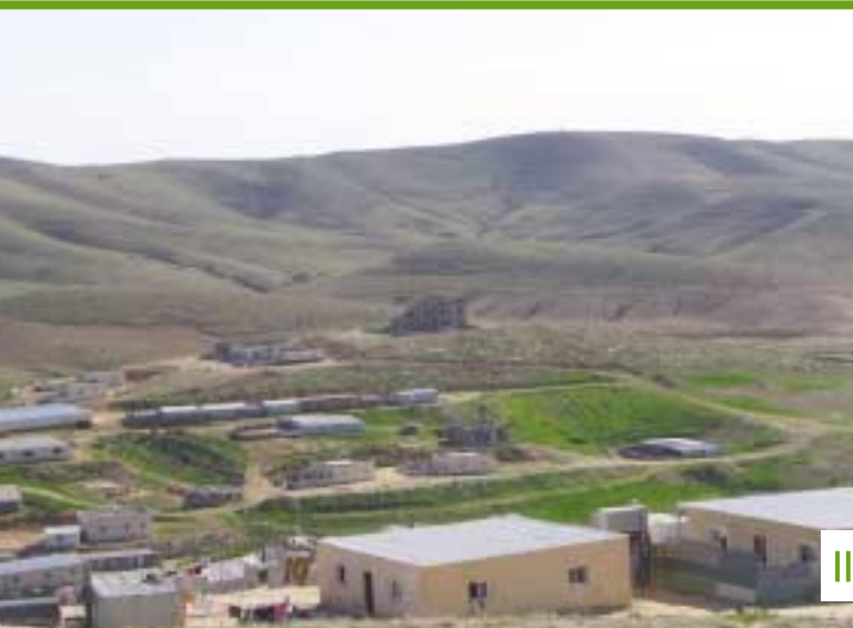
||| Houses in the "dispersal"

The rate of growth of the Negev Bedouin is the highest in the world – the Bedouin population doubles its size every 15 years. By 2020, the Bedouin population of the Negev will be 300,000.