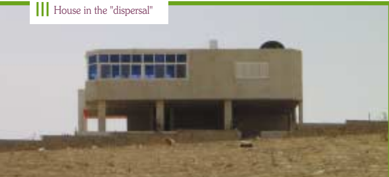
House in the "dispersal"

Bir Hadaj – Bir Hadaj is a rural-agricultural village, covering an area of 6,550 dunams. This village will be home to the Al-