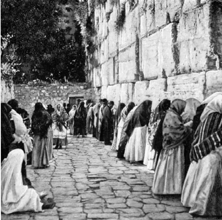
AT THE WALL OF WAILING

Published by Cosmopolitan Magazine – 1898