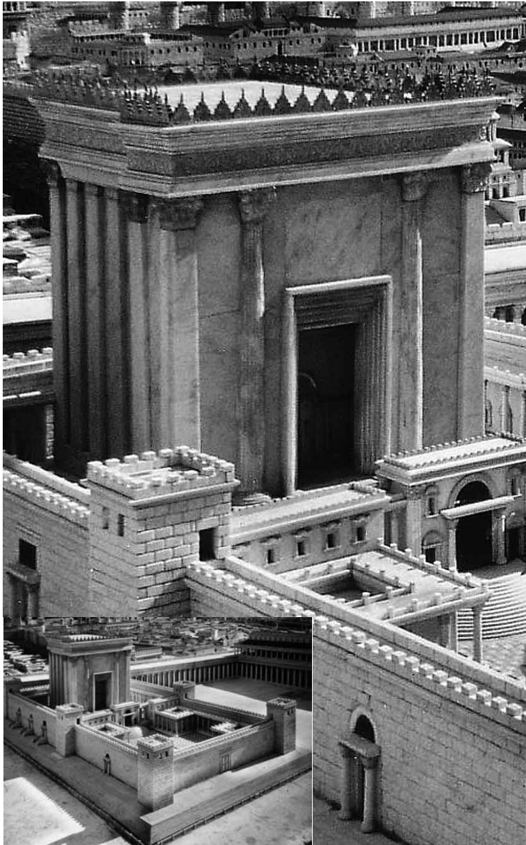
Model of Jerusalem's Second Temple